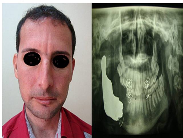
Figure 4. Photograph of one patient and OPG 1-year following surgery.