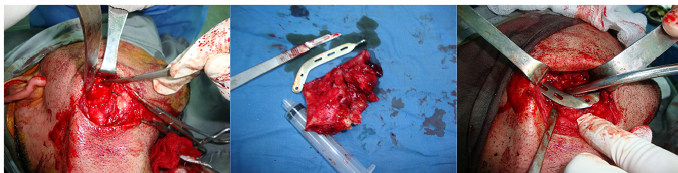
Figure 2. Resection of tumor and replacement with Bowerman Conroyd appliance.