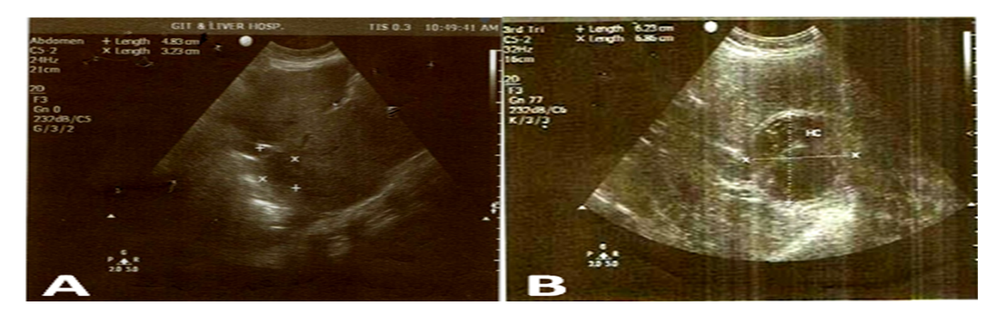
Figure 3. Liver ultrasound transverse scan showing A: cysts containing solid matrix without daughter cysts CE4 (degenerative). B: solid calcified cystic wall, CE5 (degenerative).

Regarding hepatic cyst classification was demonstrated in Table 5, we found that (35%) of patients having CE1, (35%) CE2, (i.e. patients with active disease were 70%), (17%) CE3 (i.e. transitional disease), (7%) CE4, and (6%) CE5, therefore, inactive disease represented 13% of patients.